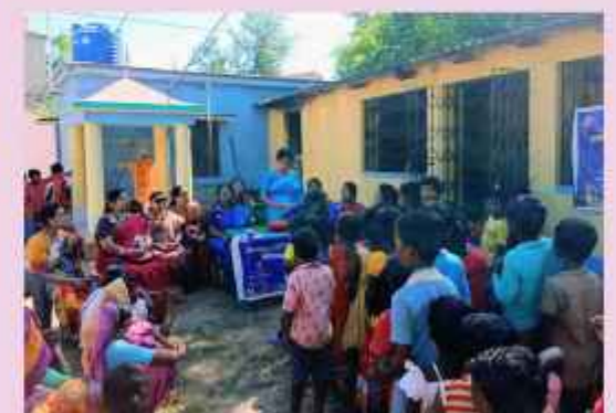
IWC SANTINIKETAN observed World Toilet Day, 19th November at the ADOPTED VILLAGE by interactive discussions and a short talk with the primary school children and the villagers present.