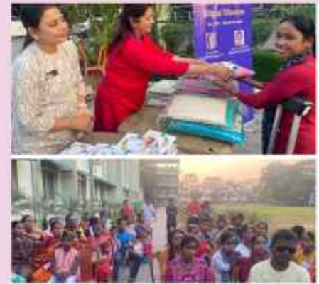
IWC SILIGURI UTTORAYON distributed new Sarees ,clothes and food packets to specially abled girls and women on the occasion of Diwali.