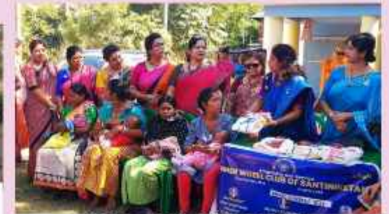
IWC SANTINIKETAN newborn mothers were given baby blankets, bibs, socks and biscuits OF ADOPTED VILLAGE