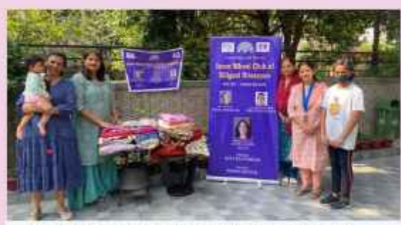
IWC SILIGURI UTTORAYON donated clothes, bed sheets and curtains to ARISE orphanage for victims of girls trafficking.