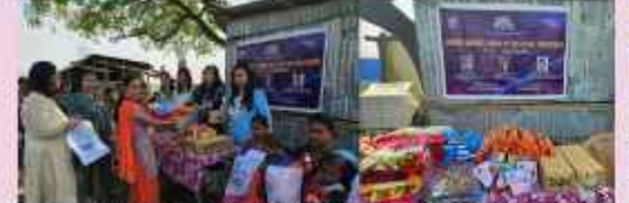
IWC SILIGURI MIDTOWN distribution of necessary items to the Mother and new born Child. The Mothers were gifted night wears and blankets were given for the new born along with nutritious food items like Horlicks and Fruits