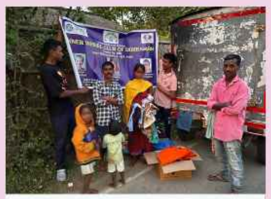
IWC DIBRUGARH distribution of unused clothes, woollens and other useful household items amongst the needy people of the adopted slum