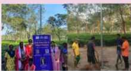
IWC SILIGURI UTTORAYON installation of Street solar light in adopted village