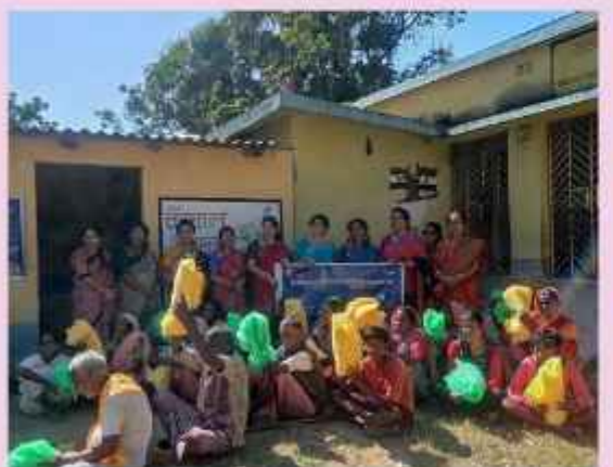
IWC SANTINIKETAN distributed twenty mosquito nets to the people of the ADOPTED SLUM