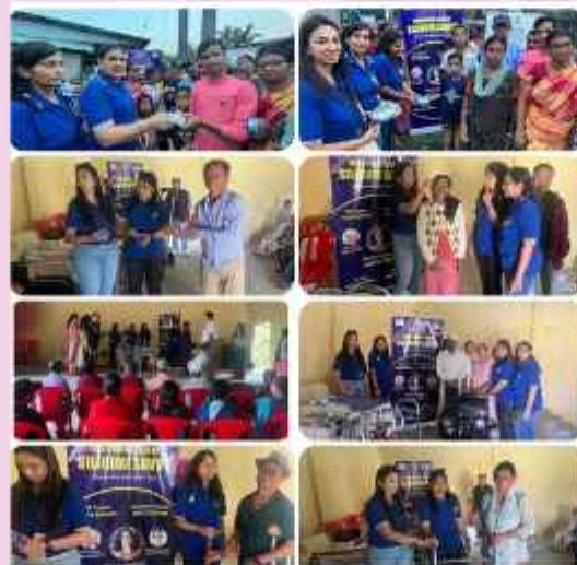
IWC SILIGURI SAVVY Hearing aids, walking sticks, walkers and wheel chairs were distributed to 100 disabled persons