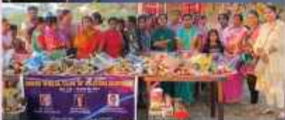
IWC SILIGURI MIDTOWN to bring the joys of this Chhath puja festival to the families of the underprivileged, our club distributed 21 Dalias ( Basket of fruits, pressed, Puja items and Sarees) to the families in our adopted best!