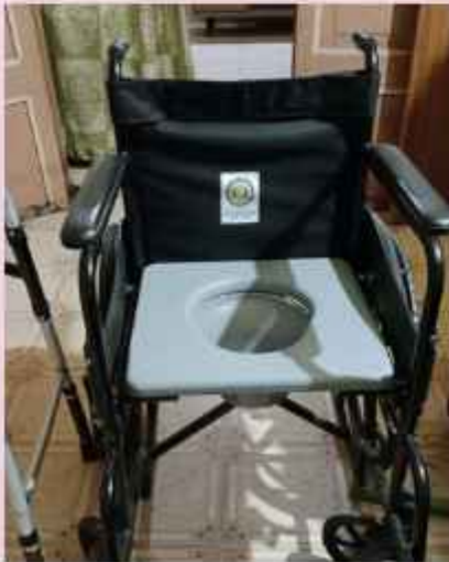
IWC DIBRUGARH donated a multipurpose mobility wheelchair with commode, and also a walker to a widow