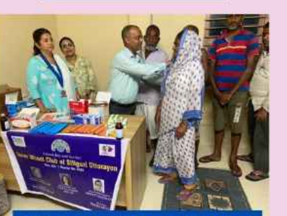
IWC SILIGURI UTTORAYAN