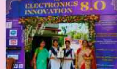
IWC ASANSOL GREATER supporting two students for their innovative ideas