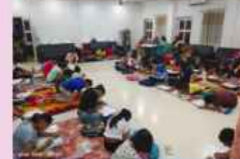
IWC TINSUKIA art competition organized in school