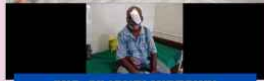
IWC SILIGURI MIDTOWN 11 Cataract surgery