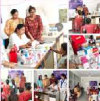
IWC SILIGURI UTTORAYAN Health check up camp