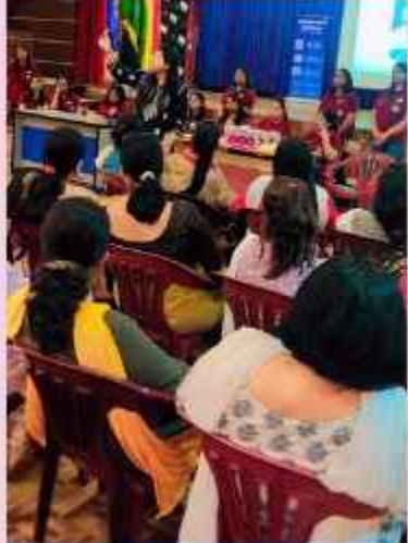
IWC SILIGURI DIVA seminar organised at BIRLA DIVYA JYOTI SCHOOL and distribution of reusable fresh pads