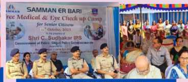
IWC SILIGURI UTTORAYAN