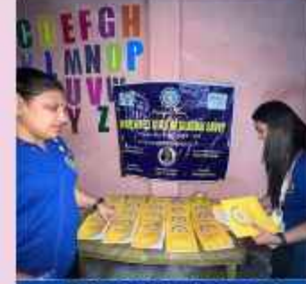
IWC SILIGURI SAWY distribution of copies