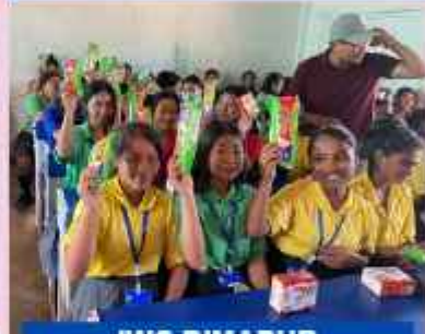
IWC DIMAPUR Distribution of fresh pads