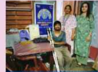
IWC DURGAPUR support to physically challenged person