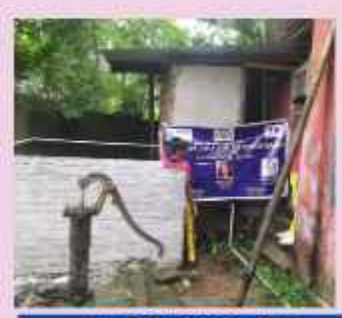
IWC DIBRUGARH Water filter being installed in adopted school