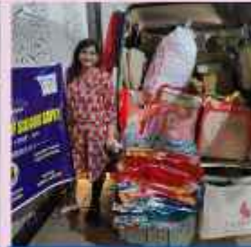
IWC SILIGURI SAVVY