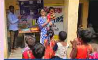
IWC DURGAPUR, GIVA Distribution of new clothes