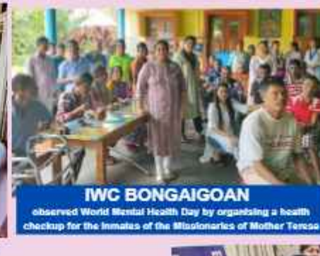
IWC BONGAIGOAN observed World Mental Health Day by organising a health checkup for the inmates of the Missionaries of Mother Teresa