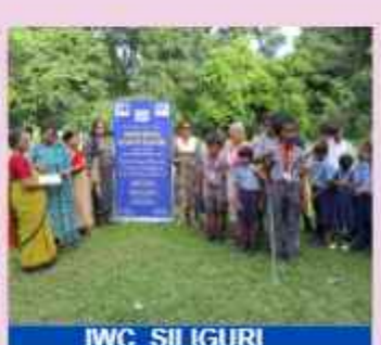
IWC SILIGURI observing white cane day in school