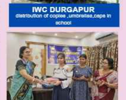
IWC ASANSOL SUPPORTED 2 GIRL CHILD