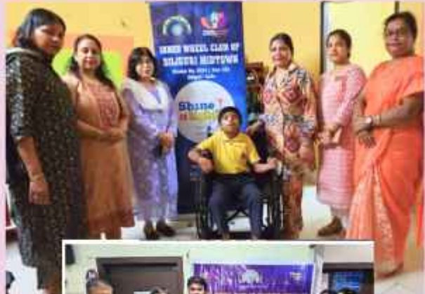
IWC SILIGURI MIDTOWN