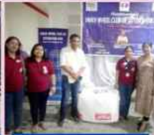
IWC SILIGURI DIVA