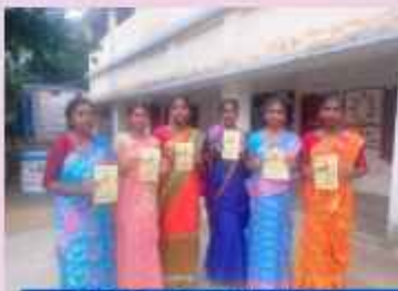
IWC SANTINIKETAN Dengue awareness program