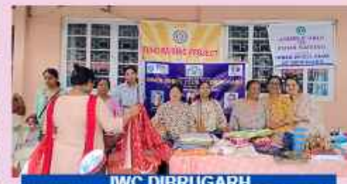
IWC DIBRUGARH The primary goal of this jumble sale was to uplift the students and villagers in need.