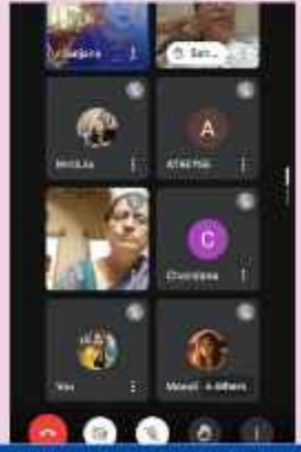
IWC SANTINIKETAN Inter District project with D329 on World Mental Health Day