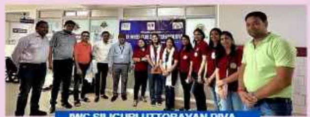
IWC SILIGURI UTTORAYAN DIVA SPONSORED 11 DIALYSIS