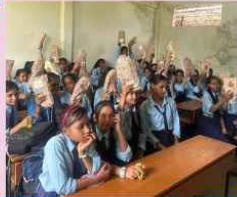
IWC DIMAPUR Distribution of fresh pads