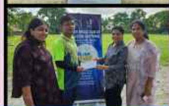
IWC SILIGURI MIDTOWN