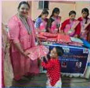
IWC DURGAPUR Distribution of new clothes