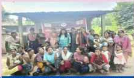
IWC JALPAIGURI PEHCHAN Distribution of fresh pads