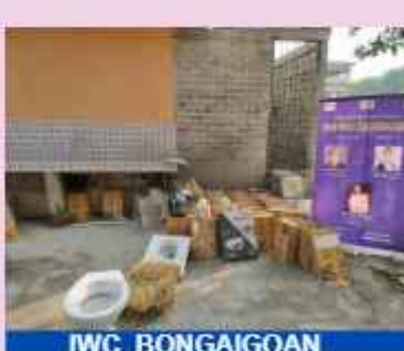
IWC BONGAIGOAN construction of 3 toilets in school