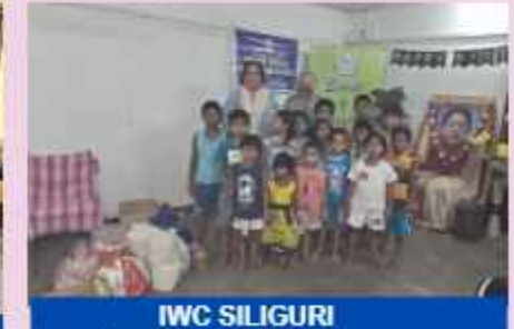
IWC SILIGURI Donation of Ration in orphanage