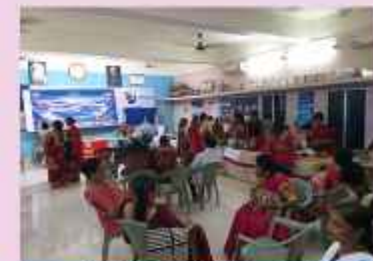
IWC SANTINIKETAN Fund raiser to support women