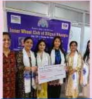
IWC SILIGURI UTTORAYAN SPONSORED 100 DIALYSIS