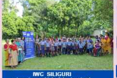
IWC SILIGURI observing world deaf day in school