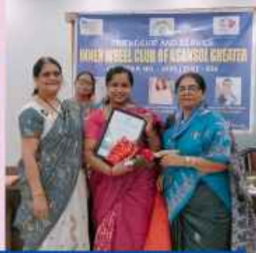
IWC ASANSOL GREATER NATION BUILDER AWARD