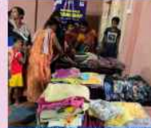
IWC SILIGURI SAVVY Distribution of new clothes