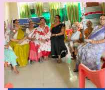
IWC TINSUKIA, MITRA