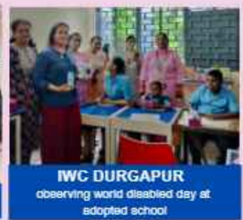
IWC DURGAPUR observing world disabled day at adopted school