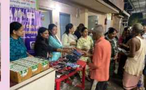
IWC SILIGURI UTTORAYAN