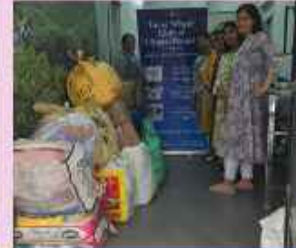
IWC SILIGURI PANACHE