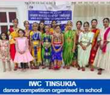
IWC TINSUKIA dance competition organized in school