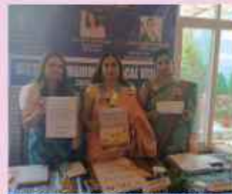
IWC PINECITY SHILLONG Rs.5000.