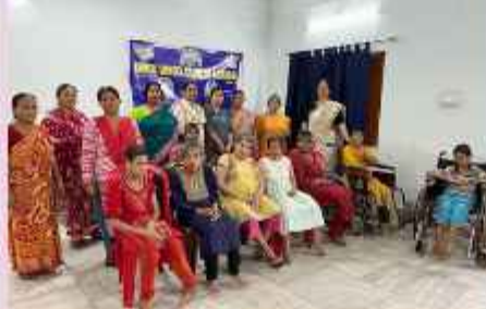
IWC ASANSOL World Mental Health Day was observed in Cheshire Home (Home for Mentally challenged and Physically disabled females).