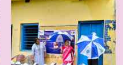
IWC DURGAPUR distribution of copies, umbrellas, caps in school