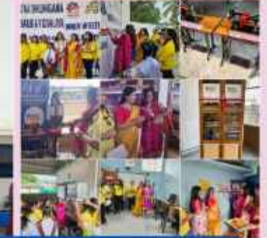
IWC ASANSOL SUPPORTED 2 GIRL CHILD