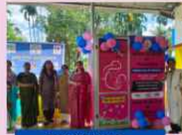
IWC SILCHAR Installation of breast feeding kiosk