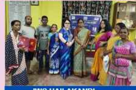
IWC HAILAKANDI Distribution of new clothes