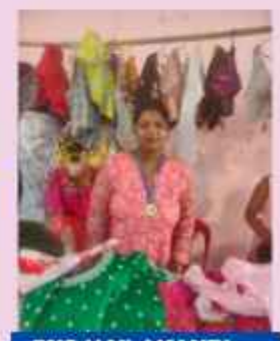
IWC HAILAKANDI Fund raiser to support women