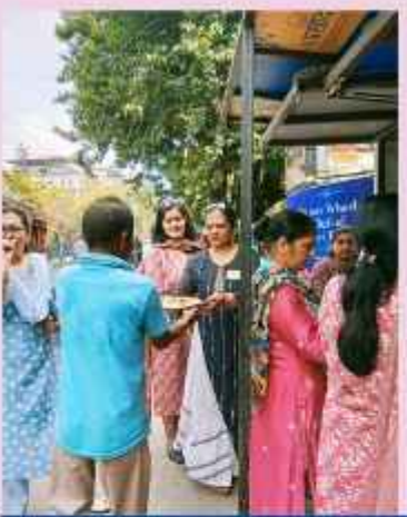
IWC SILIGURI PANACHE