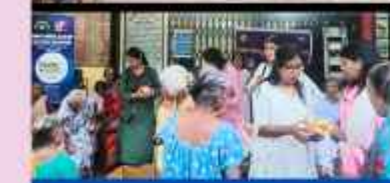
IWC SILIGURI MIDTOWN