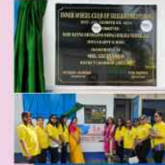
IWC SILIGURI MIDTOWN Inauguration of HAPPY SCHOOL