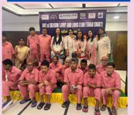
IWC SILIGURI SAVVY