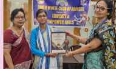
IWC ASANSOL NATION BUILDER AWARD