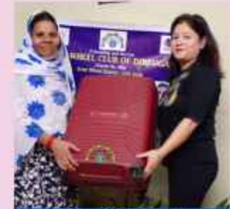
IWC DIBRUGARH wedding of a girl supported