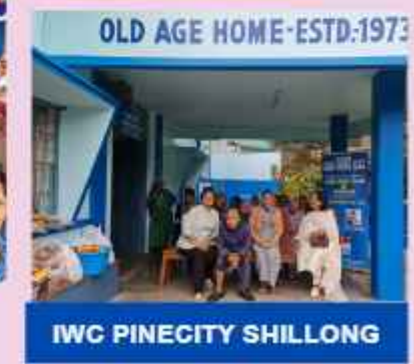
IWC PINECITY SHILLONG