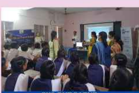
IWC DURGAPUR Installation of smart class in adopted school