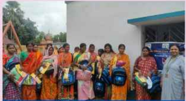
IWC DURGAPUR Distribution of fresh pads to ladies of the adopted village