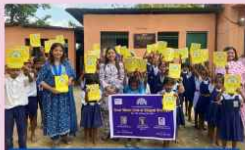
IWC SILIGURI UTTORAYAN Inauguration of HAPPY SCHOOL