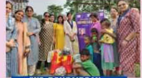
IWC BONGAIGOAN observing White Cane day