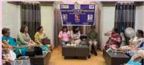
IWC DIBRUGARH An insightful talk on "Ageing Gracefully"