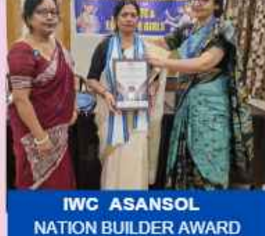
IWC ASANSOL SUPPORTED 2 GIRL CHILD