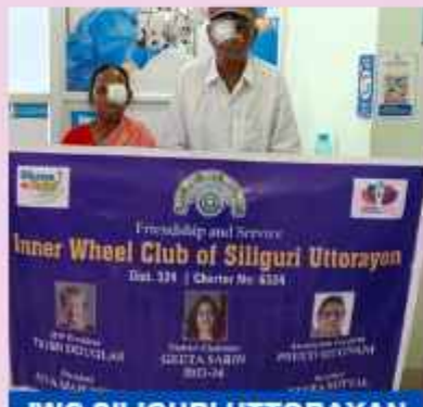
IWC SILIGURI UTTORAYAN Eye surgery of an old lady