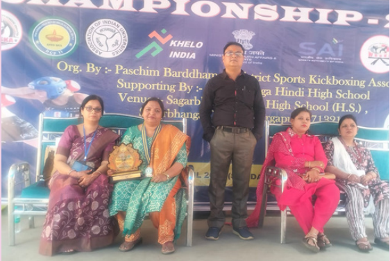
IWC DURGAPUR kick Boxing classes was introduced at Sagarbangha Hindi High school.

launched its official social media pages on Facebook and Instagram