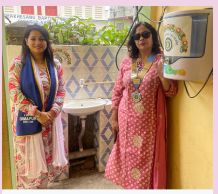
IWC DIMAPUR installed water filter in HAPPY SCHOOL

IWC DIMAPUR distributed 170 school bags to all the students of happy school .