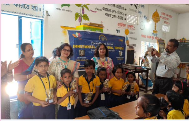
IWC TINSUKIA MITRA DC visited adopted school Tingrai Habi L.P School and awarded the toppers of each class with trophy,