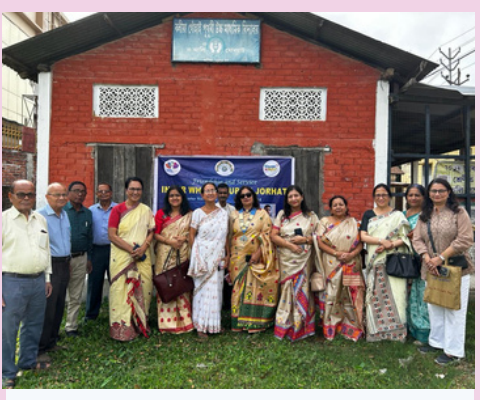
IWC JORHAT DC madam visited HAPPY SCHOOL.After inspection of the school District Chairman gave her valuable suggestions regarding improvement of the school.