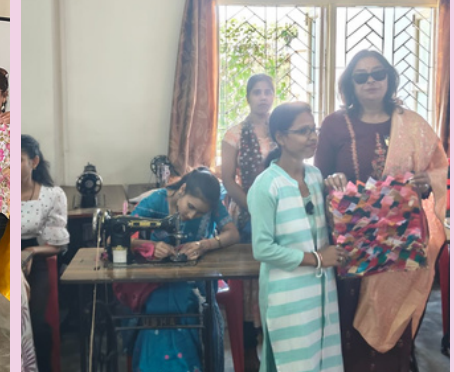
IWC DIBRUGARH Reduce,Reuse.Recyle-Assan Making From Cloth Scraps At Skill Development

Completion Certificates N Employment Oppurtunities For 8 Girls Along With Exhibiting The Works At Skill Development Centre On DC Visit