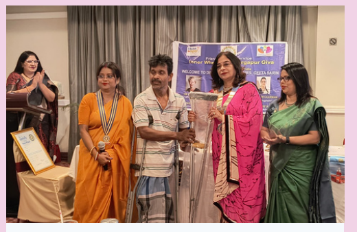
IWC DURGAPUR GIVA donated two sets of crutches to two beneficiaries..