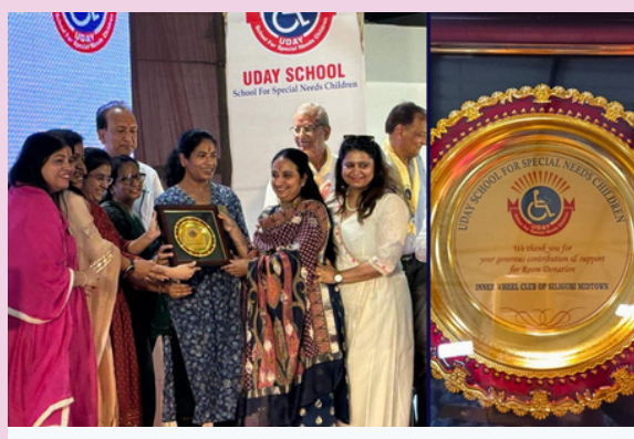
IWC SILIGURI MIDTOWN donated fund for Uday School ( school for special children ), for their new building construction . Amount spent -Rs.30000

IWC DURGAPUR GIVA distributed new clothes to all the inmates of the oldage home.