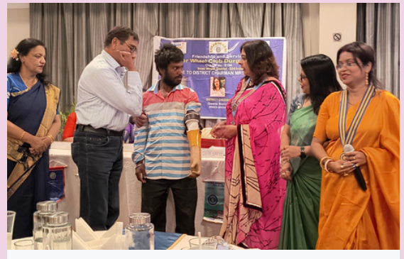
IWC DURGAPUR GIVA donated prosthetic artificial limbs to two beneficiaries.