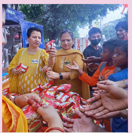
IWC SILIGURI PANACHE Distribution of food and Drinks in Ram Nawni Rally in the city