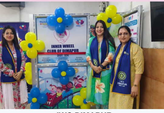
IWC DIMAPUR breast feeding kiosk inaugurated