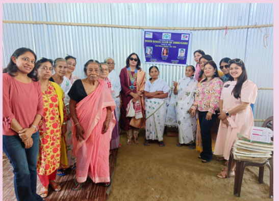
IWC DIBRUGARH Kitchen Aid Setup Along With Skill Development on DC Visit # A Adopt & Build #Adopted Old Age Home #Commitment To Senior Citizen

IWC DIBRUGARH donating IWC Dibrugarh logo Umbrella to under privilleged At Skill Development Centre On DC Visit