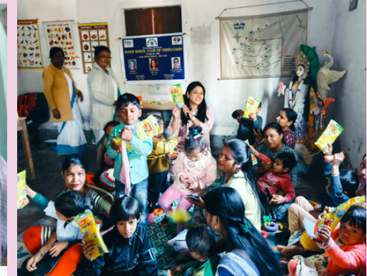
IWC DIBRUGARH 50 Art Sets Donation For Skill

IWC SILIGURI UTTORAYON BUILD BRAND IDENTITY- Fund Raiser for "Wings of Hope"