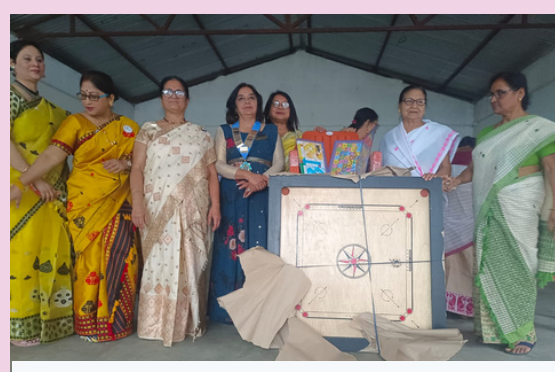
IWC DULIAJAN DC visitedthe adopted Happy School (Bamhukuta Primary School). Materials for educational purposes were graciously donated to the adopted school.

IWC DULIAJAN DC visited Hello Milo centre to interact with peoples and donated some essential things for village peoples. We donated 20 chairs and three dustbins for adopted village .