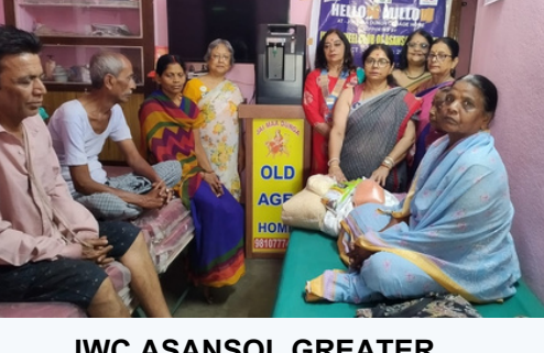
IWC ASANSOL GREATER donation of water filter and food items in old age home