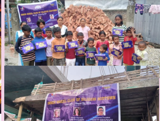
IWC SILIGURI MIDTOWN donated 1 truck of brick and 50 bags of cement to a family for building their pucca house.