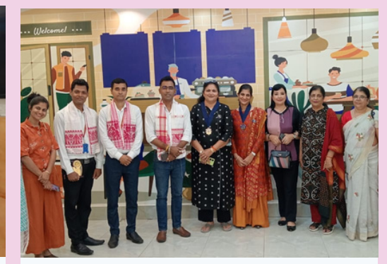
IWC BONGAIGOAN Felicitation of staff