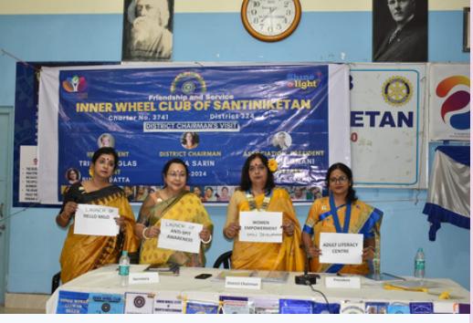
IWC SANTINIKETAN DC madam launched Adult Literacy Centre

supported the eye surgeryof a 62 years old, driver who was suffering from Pterygium, an abnormal growth of tissue on the conjunctiva and the adjacent cornea.