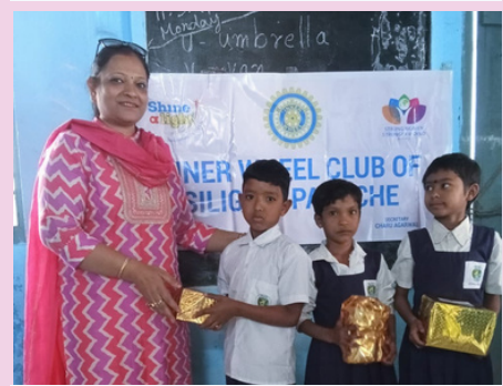
IWC SILIGURI PANACHE drawing competition @ Happy school