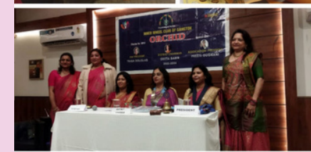
IWC GANGTOK ORCHID