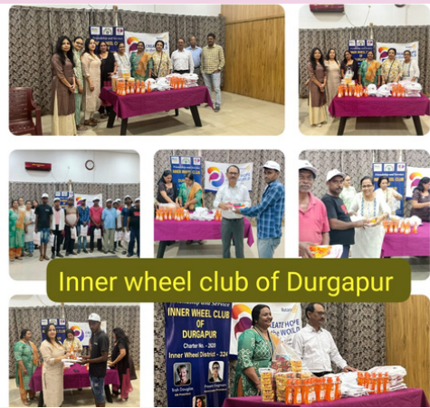
Inner wheel club of Durgapur

gifted handwash and towels to 25 hygiene workers Food packets and branded IWC caps were distributed.