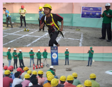
IWC SILIGURI MIDTOWN 4th March is celebrated as National Safety Day. Today our members visited a construction site in Dagapur and demonstrated various safety measures which need to be adopted while working.