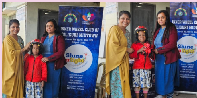
IWC SILIGURI MIDTOWN

sponsored 4 girls for training in beautification course