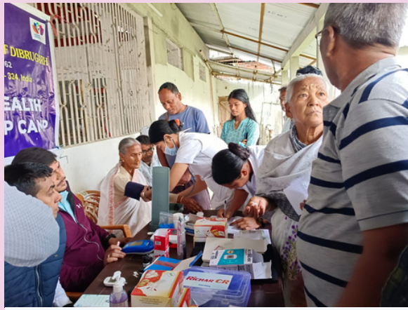
IWC DIBRUGARH MAJOR HEALTH CHECK UP CAMP