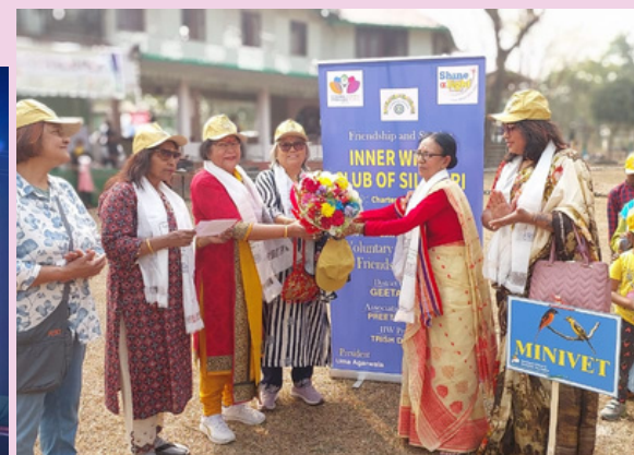
IWC SILIGURI Felicitation of Padamshree Awardee Parvati Barua