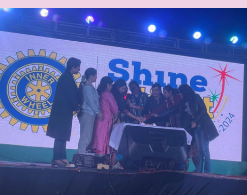
IWC BONGAIGOAN Branding of IWC