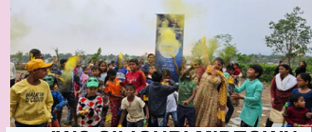
IWC SILIGURI MIDTOWN Holi celebration with underprivileged children