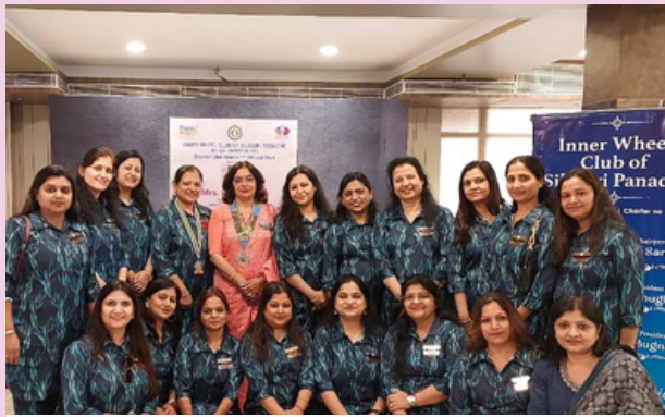
IWC SILIGURI PANACHE