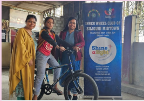
IWC SILIGURI MIDTOWN donated one bicycle to a poor girl.