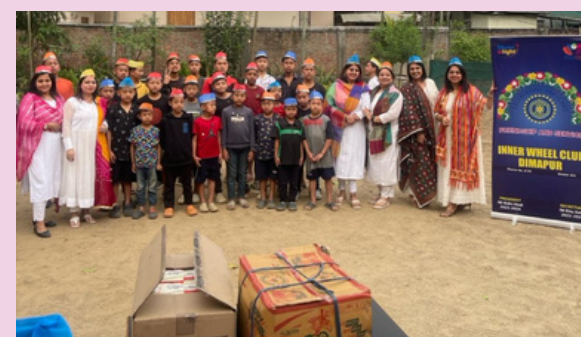
IWC DIMAPUR Holi celebration with underprivileged children