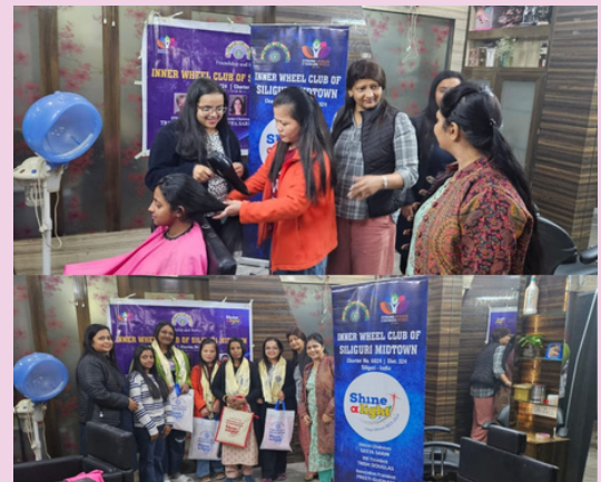
IWC SILIGURI MIDTOWN

sponsored 4 girls for training in beautification course